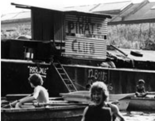
[1]12 boats, 10 canoes, 100 members or so, at the Pirate Club on