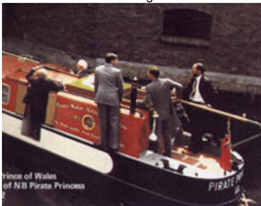
[25]As Charles will be our king one day, they didn't let us ransom him,

let us lock him in our dungeon and his ransom helped pay for the Pirate Castle