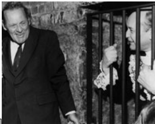
[24]The Lord Mayor

let us lock him in our dungeon and his ransom helped pay for the Pirate Castle