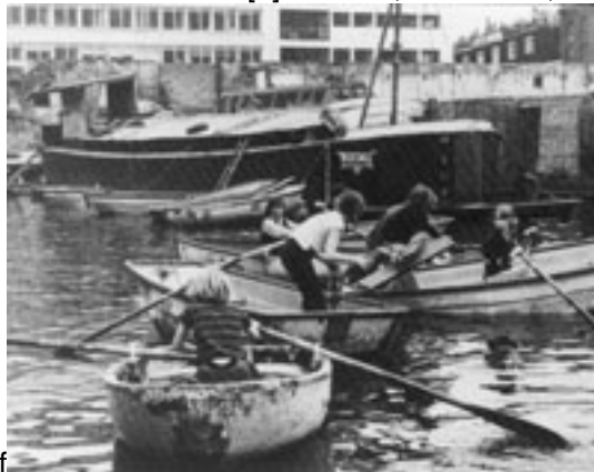
Rosedale at Gilbeys Wharf