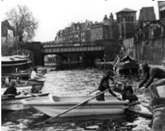
[3]Voluntary work on the canal means you also get out of it what other