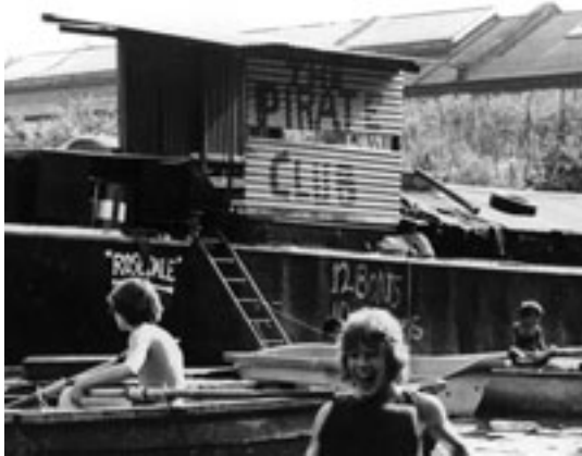
[1]12 boats, 10 canoes, 100 members or so, at the Pirate Club on