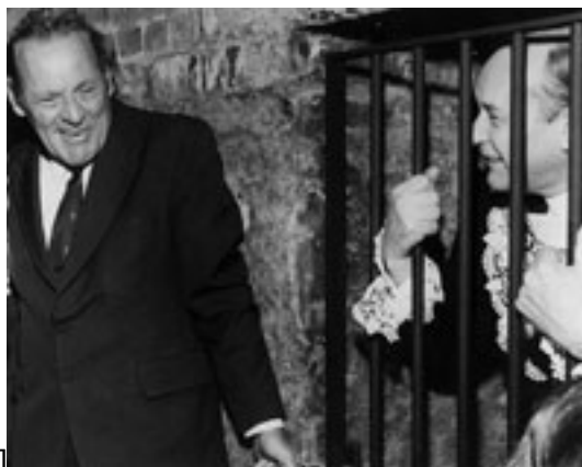
[24]The Lord Mayor

let us lock him in our dungeon and his ransom helped pay for the Pirate Castle